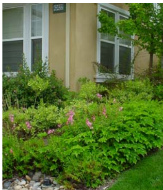
Rooftop runoff drains to bubbler in landscaped area, Fremont

The development or redevelopment of property represents an opportunity to incorporate controls that can reduce water quality impacts, not only during construction, but also over the life of the project. The countywide NPDES permit includes substantial new requirements for new development and redevelopment projects, similar to other Bay Area municipal stormwater NPDES permits.