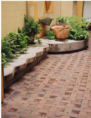
Ungrouted modular pavers promote infiltration, Berkeley