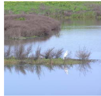
Runoff is treated in detention basin, Pleasanton