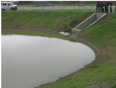
Detention pond in Pleasanton provides stormwater treatment and hydromodification management.

Flow duration controls are designed so that the post-project stormwater discharge rates and durations match the pre-project rates and durations from 10 percent of the pre-project 2-year peak flow up to the pre-project 10-year flow. Projects that require flow duration controls typically require water quality treatment controls as well (see fact sheet on stormwater quality requirements, referenced below). If feasible, combining flow duration and water quality treatment into one facility can reduce the land area needed for stormwater management.