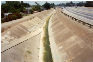
Example of an engineered channel.

In the past, creek bank erosion was addressed by constructing engineered channels. But this created new problems for salmon and other migratory fish, and in some locations resulted in excessive sedimentation in the channels, requiring costly maintenance.