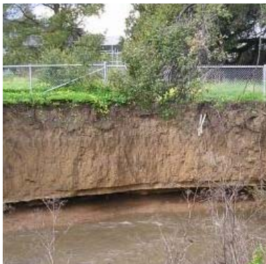
Example of creek bank erosion.

When undeveloped land is covered with buildings and pavement, it causes more stormwater runoff to flow into creeks at faster rates. This may result in creek channel erosion, as well as flooding, habitat loss, and, in some cases, property damage. These development-induced changes to the natural flow of stormwater and creeks are called hydromodification.