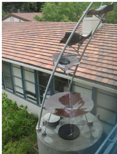
Sculpture collects and stores roof runoff at Mills College in Oakland.

The design of flow duration controls is based on hydrologic simulation modeling. To help applicants with this, ACCWP has worked with the Santa Clara Valley Urban Runoff Pollution Prevention Program and the San Mateo Countywide Water Pollution Prevention Program to develop the Bay Area Hydrology Model (BAHM). On-site and regional control measures designed appropriately using the BAHM and local requirements will meet the permit's HM requirements. The BAHM and its user manual can be downloaded at www.bavareahydrologymodel.org .