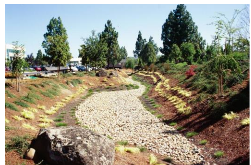
Photo 8-5. Extended Detention Basin, Palo Alto