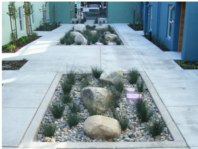
Photo 8-2. Flow through planter in the City of Emeryville