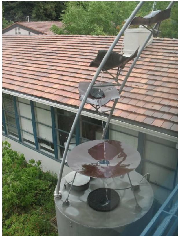
Photo 8-8. Rainwater harvesting system, Mills College, Oakland