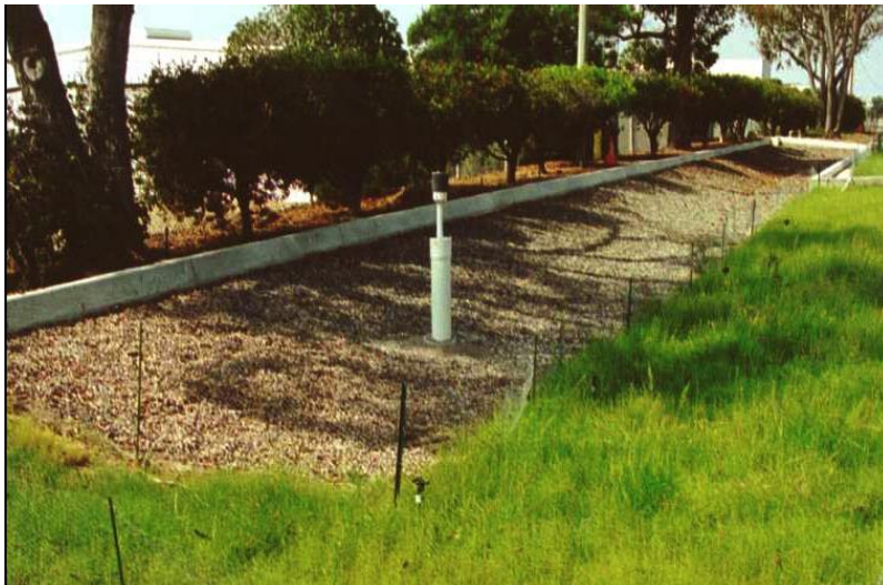
Photo 8-4. Infiltration Trench

(Source: California Stormwater Quality Association)