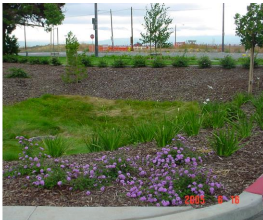
Photo 8-1. Bioretention Area in the City of Fremont