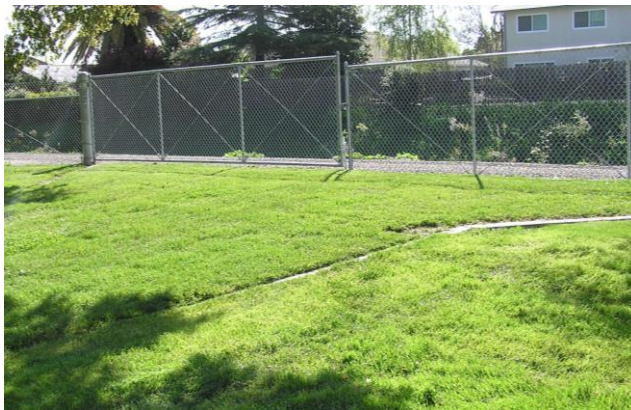
Photo 8-7. Turf block fire lane