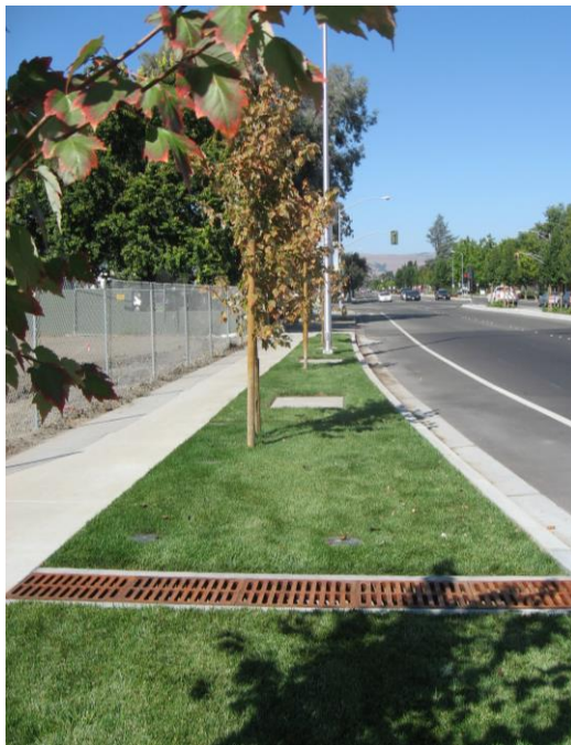
Photo 8-3. Series of non-proprietary tree well filters installed along roadway, City of Fremont